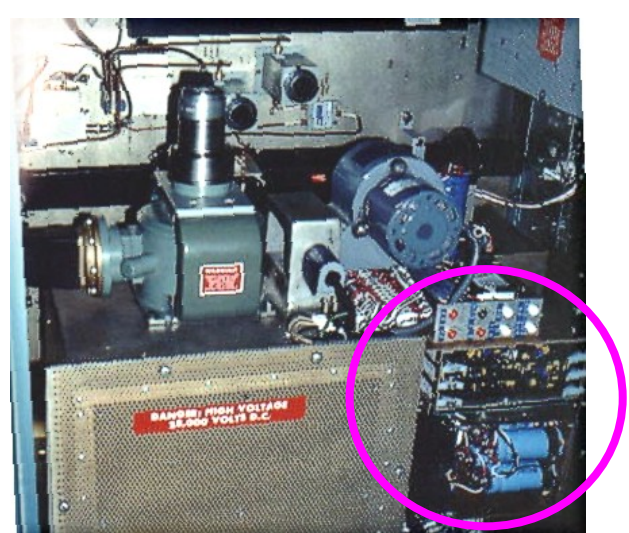
Solid State Modulator Upgrade Applicable To Many Existing Thyratron Radars